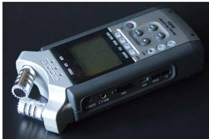
Zoom H4n microphone

Another option is to record the audio and video at the same time, but in small sections, which you edit together for the final video. One tip is to move the camera between shots to make the cuts look more natural and planned. You could, for example, decide on three camera positions—left, front, and long shot—and move the camera between positions for each of the sections you play.