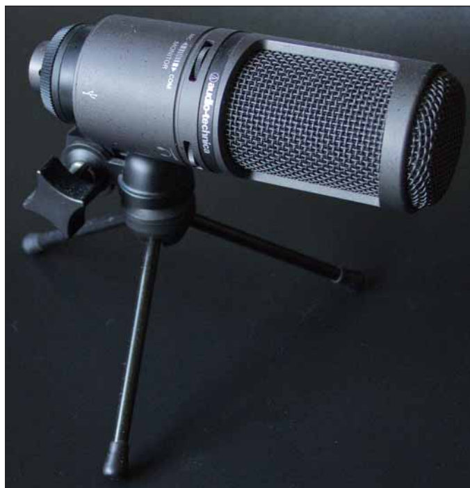
Audio-Technica AT2020USB+ microphone

Obviously, you need a computer! I use an Apple Mac, but any desktop or laptop will do. The more modern and powerful, the better, as audio and video editing is processor intensive. Some older computers can be very slow, and some may not be able to cope at all when editing multiple video and audio tracks.