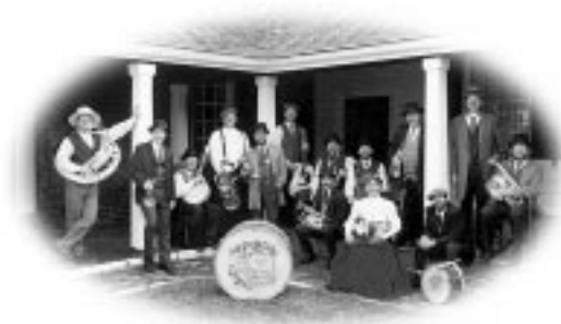
Mr. Jack Daniel's Original Silver Cornet Band