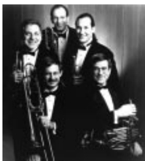
American Brass Quintet