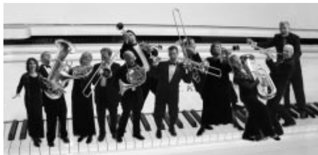
The Denver Brass