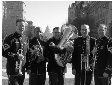
Army Brass Quintet