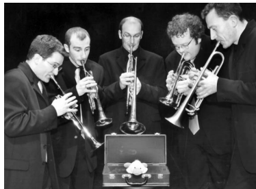
Ensemble de Trompettes de Lyon