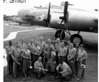
Dimensions in Blue

Artists and events subject to change without notice. For the latest and most up-to-date information log on to: www.trumpetguild.org