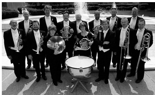
Washington Symphonic Brass