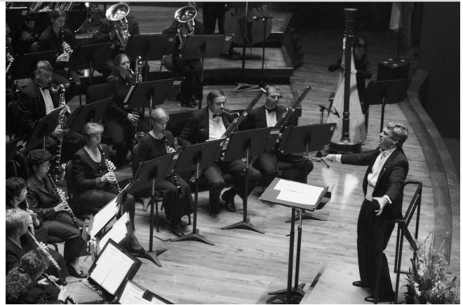
Dallas Wind Symphony